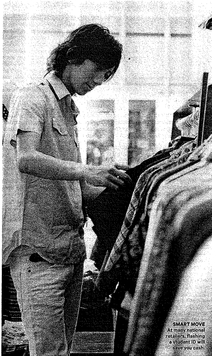
SMART MOVE At many national retailers, flashing a student ID will save you cash.

Find out which businesses offer significant and surprising discounts